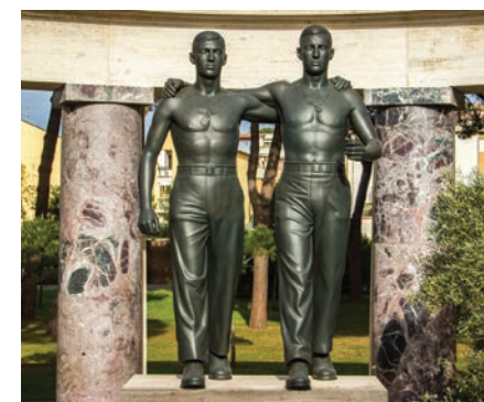
The “Brothers in Arms” sculpture is the central feature of the peristyle.

“The “Brothers In Arms” sculpture represents an American soldier arm in arm with an American sailor. The statue symbolizes the fraternity between the U.S. Army and Navy that was essential to the success of the three amphibious assaults in Italy during World War II. The two servicemembers can be distinguished via small differences in their identification tags, belt buckles, and trouser pockets. The bronze sculpture is by Paul Manship of New York. It was cast at the Battaglia Foundry in Milan.