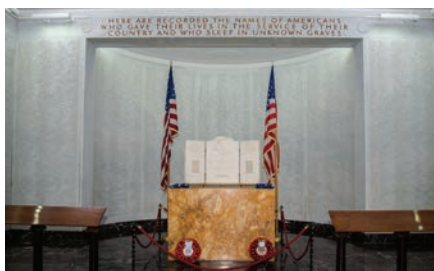
The altar, flanked by Tablets of the Missing.

On the altar of golden Broccatello Siena marble is a triptych of Serravezzo white marble from the Carrara region designed by Paul Manship. Carved in relief on the side panels of the triptych are angels holding palm branches. The left panel bears a quotation from Psalm 8:3-5 with reference to the sculptured ceiling dome.