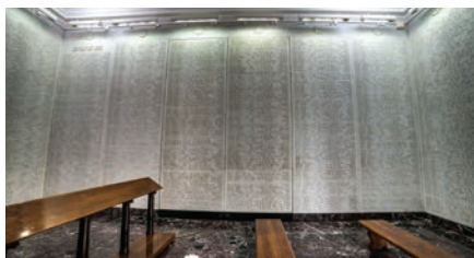
Brigadier General Charles L. Keerans, Jr. is the highest –ranking among the 3,095 individuals whose names and information are inscribed here.

These servicemen and women were Missing in Action or were lost or buried at sea. They represent every state in the Union and the District of Columbia.