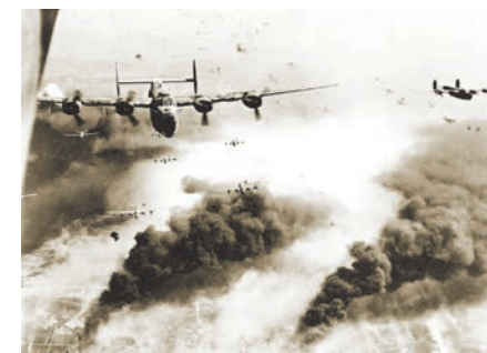
Fifteenth Air Force B-24 Liberator bombers fly over the Concordia Vega Oil refinery in Ploesti, Romania, after dropping their bomb loads on the oil cracking plant. May 31, 1944.

The 332nd Fighter Group deployed to Italy in February 1944, flying P-51 Mustang fighter airplanes. It was tasked with escorting Fifteenth Air Force heavy strategic bombers. The group became known as the "Red Tails" because of the crimson unit identification on the tail of their aircraft.