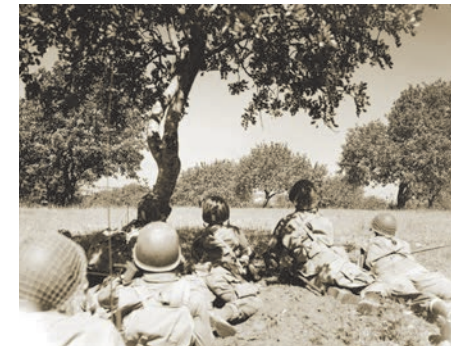
82nd Airborne Division paratroopers at Biazza Ridge, Sicily, the second day after their night jump on July 9, 1943.

The American Seventh Army moved to capture the city of Palermo, the capital of Sicily. The British under Gen. Bernard Montgomery were to advance and capture Messina in the northeastern corner to cut off the Germans from crossing to the Italian mainland. The Germans and Italians made skillful use of rough terrain augmented by minefields, but American