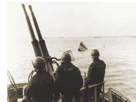
Sailors at a 40 mm anti-aircraft gun mount aboard USS Brooklyn (CL-40) observe USS Portent (AM-106) sinking off Anzio after hitting a mine on D-Day, January 22, 1944.

As the Anzio struggle was being fought, the Allies mounted major attacks on Cassino and Monte Cassino in February and March. The Germans repulsed the attacks, with heavy casualties to the Allies forces.