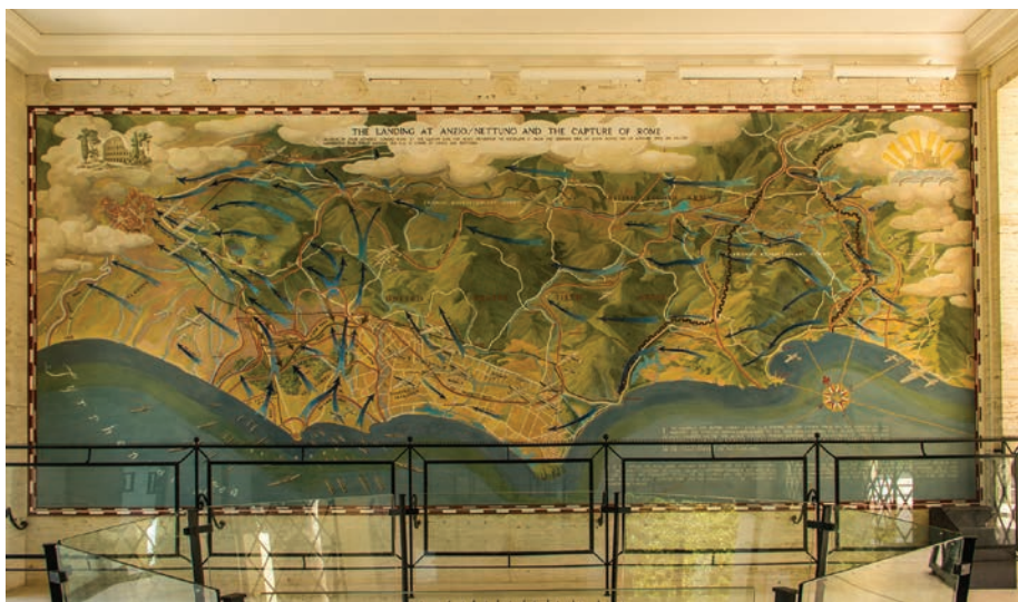
The map on the east wall is named “The Landing at Anzio/Nettuno and the Capture of Rome.”

On the west wall are three maps – “The Capture of Sicily,” “The Strategic Air Assaults” and “The Naples-Foggia Campaign.” To aid in understanding them, the maps bear explanatory inscriptions. Beneath the maps are two sets of key maps, “The War Against Germany” and “The War Against Japan.”