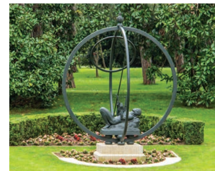
A statue of Orpheus rests on the armillary sphere in the South Garden.

On the east wall is one large map, “The Landing at Anzio/Nettuno and the Capture of Rome.” This map portrays the landings in the vicinity of Anzio, the establishment of the Anzio beachhead, the subsequent fighting therein, the final breach of the Gustav Line on May 11, 1944 by American and Allied forces, the swift Allied advance north, the link up with troops breaking out of the Anzio beachhead, and the liberation of Rome on June 4, 1944.