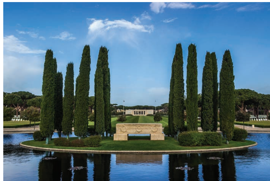
The reflecting pool with cenotaph.

The cemetery sits in the zone of advance of the U.S. 3rd Infantry Division during the Anzio-Nettuno campaign beginning in January 1944. A temporary wartime cemetery was established here on January 24, 1944, two days after the units of the VI Corps landed on the beaches nearby.