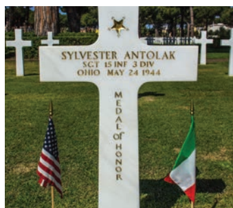
Sylvester Antolak’s headstone.