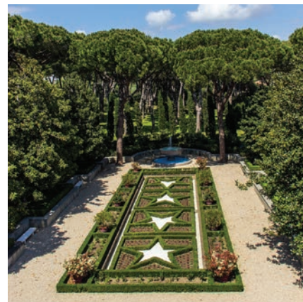
The North Garden.

At the far end of the garden is a Baveno granite fountain consisting of a large-semi-circular bowl on a wide pedestal. It was carved from a single piece of granite quarried near the north end of Lake Maggiore. Cascades of water flow from the bowl into a low basin.