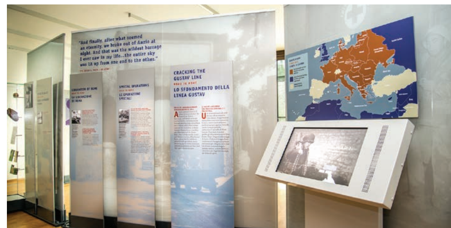
Interactive touchscreen kiosk stations enable visitors to explore the details of the several campaigns represented here.

Restrooms are conveniently located in the visitor center.