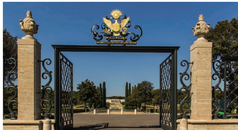
The U.S. seal surmounts the cemetery’s entry gates. Immediately inside to the right are the visitor building and the visitor center.

THEY DIED THERE VALIANTLY AND HEROICALLY, GIVING THEIR LIVES THAT PEOPLES OF EUROPE MIGHT BE LIBERATED FROM TYRANNY. ... THEY REST TRANQUIL AND SECURE IN THE FRIENDLY SOIL OF ITALY. MAY OUR GREAT DEBT TO THEM, AND ALL OTHERS WHO DIED IN THE CAUSE OF FREEDOM, SERVE AS AN INSPIRATION TO ALL PEOPLES TO DEDICATE THEMSELVES TO FREEDOM AND LASTING PEACE.