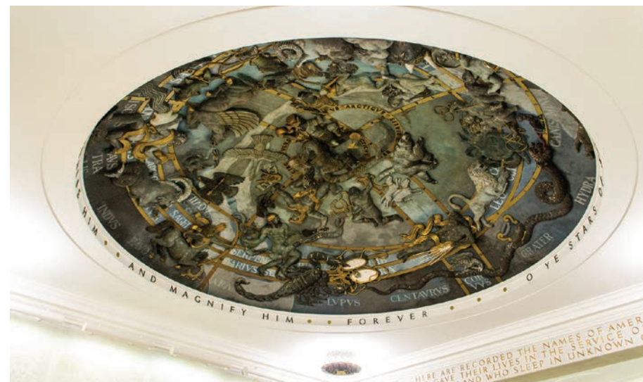
The chapel ceiling dome structure.

O YE STARS OF HEAVEN BLESS YE THE LORD PRAISE HIM AND MAGNIFY HIM FOREVER.