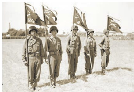
Guidon bearers of the 100th Battalion, 442nd Regimental Combat Team. The Japanese American unit was among those reaching the Arno River area on July 23, 1944.

The Allies broke through the Gustav Line on May 13. They pushed on to link up with the Anzio beachhead and overrun subsequent German defensive lines. On June 4, 1944 American units entered Rome and liberated the first European capital city of the war.