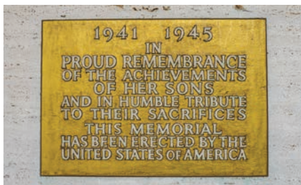
"The Dedication Tablet"