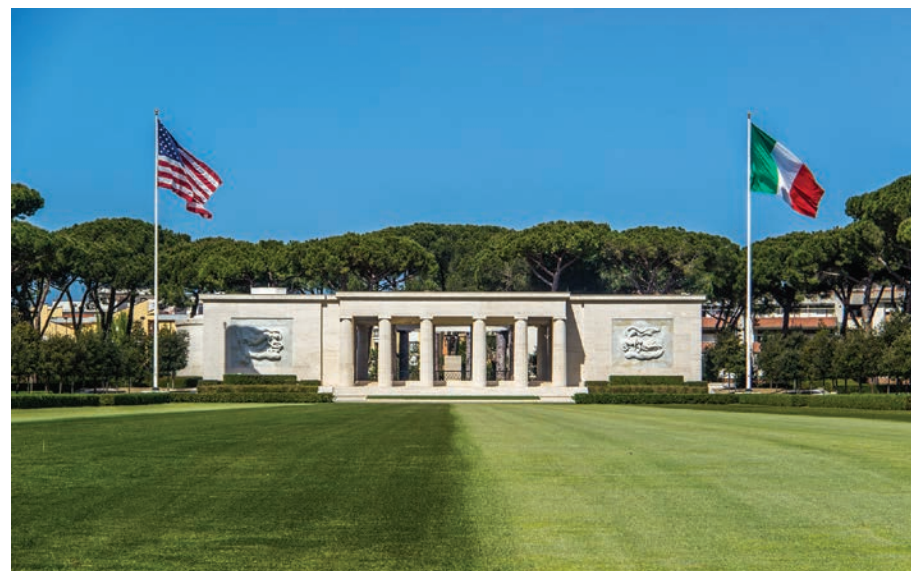
The memorial viewed from the east.