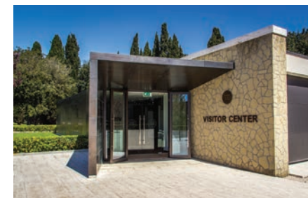
Entrance to the visitor center.

Dedicated in 2014, the 2,500 square-foot visitor center is adjacent to the visitor reception and family room located just to the right (North) of the cemetery entrance. The visitor center provides visitors the opportunity to meet members of the cemetery staff. They are happy to answer visitors’ questions and to provide information about the cemetery.