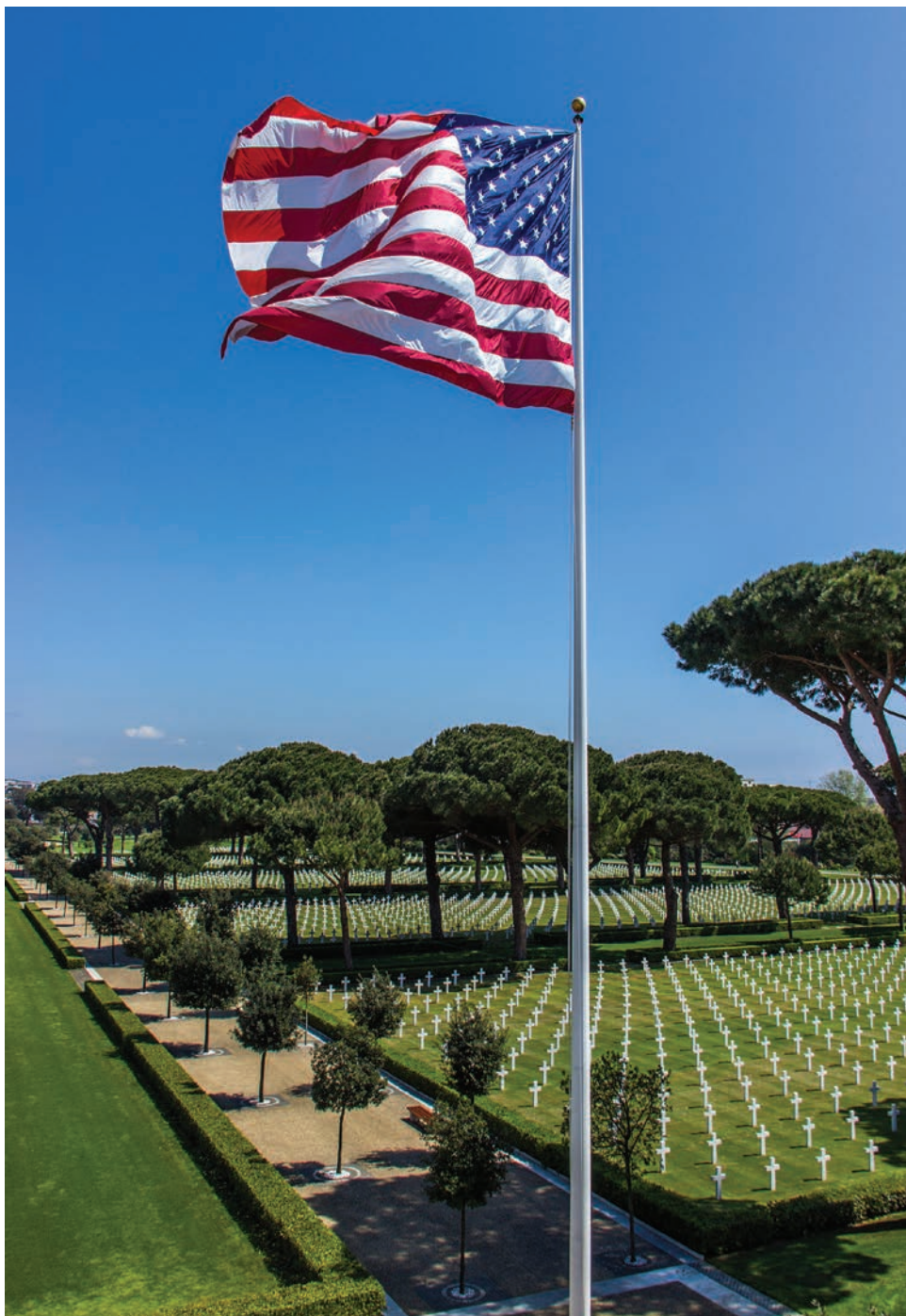
The graves area is seen looking eastward from the Memorial.