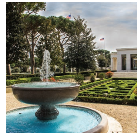
The granite fountain in the North Garden