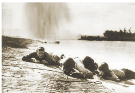
U.S. Coast Guardsmen and Navy beach battalion men hug the shaking beach south of Salerno as a Nazi bomber unloads on them. September 1943.

The Germans and Italians decided to withdraw from Sicily. Fighting a skillful delaying action, they evacuated 100,000 troops from the island during August 3-16. These included three German mechanized divisions, their best and most mobile forces. Less mobile infantry and coastal defense units generally surrendered. The American 3rd Infantry Division entered Messina on the night of August 16.