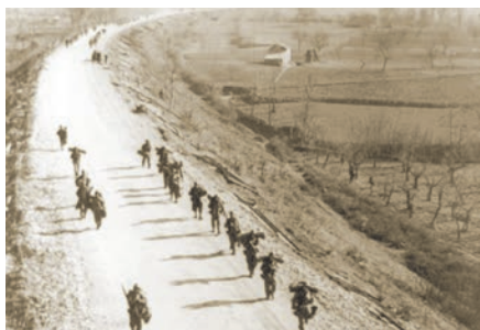
Two columns of U.S. soldiers march northward along Italy's highway 6—the famous "Road to Rome"—at a position south of Cassino, January 31, 1944.