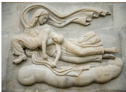
“Resurrection” panel.

The map room is entered through bronze gates. An octagonal table inset with a circular relief map of Italy occupies the center of the room. The map is of bronze, inset with marble mosaic tile in various shades of blue depicting the sea areas. It was fabricated by Bruno Bearzi from information supplied by ABMC. It shows in general outline the American military operations in Sicily and Italy during the period 1943-45.