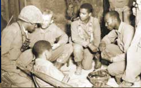
Officers of the 92nd Infantry Division plan crossing of the Arno River, Sep. 1, 1944.