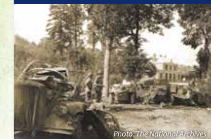
American soldiers stop German attack near Mortain

A sculpture group titled "Youth Triumphant Over Evil," executed in Chauvigny limestone from the Poitiers region, graces the east end of the Memorial Building.