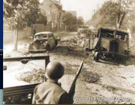
American soldiers in Avanches